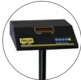
▶ SPP - PFBL