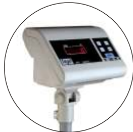
▶ SPP - PFABS